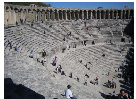
The Theatre at Aspendos, Turkey

The strategy of the C&MA has been to identify peoples who have never heard the gospel of Jesus Christ. And then take steps to pray for them and seek the Lord as to how we can tell them the good news. As such, four areas of the world that are home to millions of these least-reached people have been identified. To identify these regions and make it easy to remember them in prayer, C&MA have created the Five "S" Venture to underscore our desire to reach people in these regions. The five "S" are: S ilk Road, S un, S and, S pice, and newly added to this group is S ea to S ea.